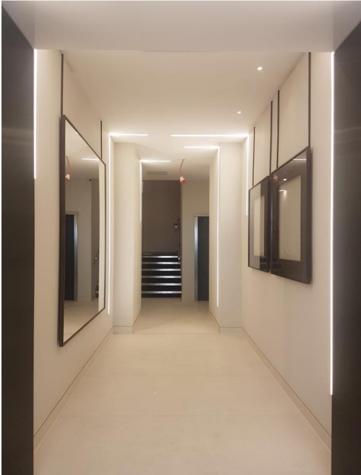
Ground floor entrance- Newly refurbished