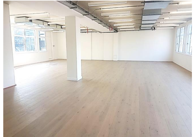
Refurbished 4 th Floor Office