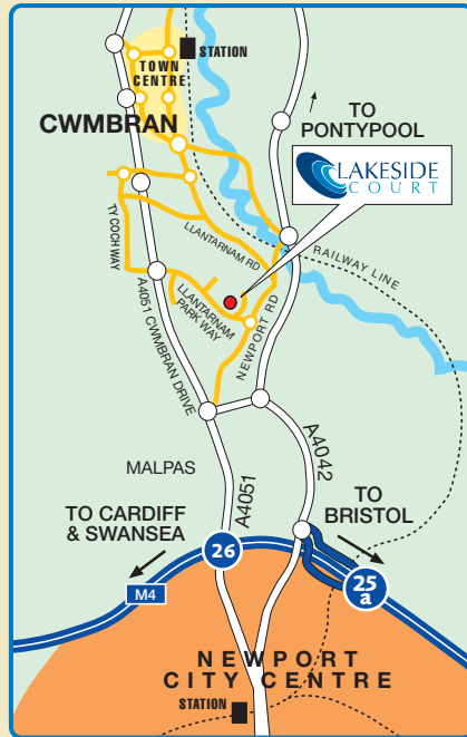
Plans are for identification purposes only. Not drawn to scale.

Cwmbran town centre is approximately 1.5 miles from Llantarnam Park, where there is an extensive range of shopping and around 3,000 free car parking spaces available within the Cwmbran shopping centre, which is shortly to undergo further redevelopment.